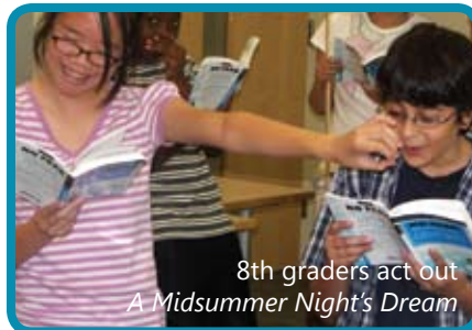
8th graders act out A Midsummer Night's Dream