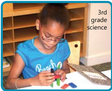
3rd grade science

Researchers have found that "active-learning practices have a more significant impact on student performance than any other variable, including student background and prior achievement" (Darling-Hammond, et al, 2008). In 2009-2010, SOH students made substantial gains in their education by participating in projects such as: