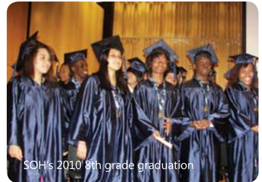
SOH's 2010 8th grade graduation

A. Philip Randolph HS Art and Design HS Bronx HS of Science (3 students) Cardinal Hayes HS Cardinal Spellman HS Cathedral HS (Catholic) Cristo Rey (2 students) DeWitt Clinton/MACY Honors Program Eleanor Roosevelt HS Fordham Prep Frank McCourt HS HS of American Studies at Lehman College HS of Fashion Industries HS of Math, Science, and Engineering at CCNY (2 students) Hunter HS (SOH 7th grader accepted) LaGuardia HS Manhattan Center for Science and Mathematics (3 students) Monsignor Scanlan HS Mott Haven Village Preparatory Portchester HS Renaissance HS Riverdale/Kingsbridge Academy St. Raymond's HS for Boys Harry S. Truman HS West Bronx Academy for the Future