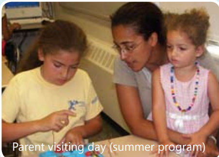
Parent visiting day (summer program)