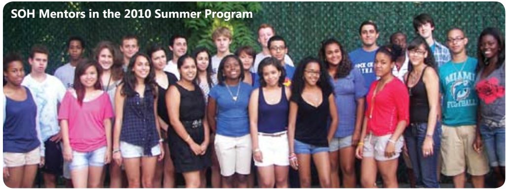
SOH Mentors in the 2010 Summer Program

One hundred and eighty-five SOH alumni have enrolled in college since 2004. Congratulations to recent graduates from Barnard College, Fordham University, UPenn/Wharton, and other colleges and universities!