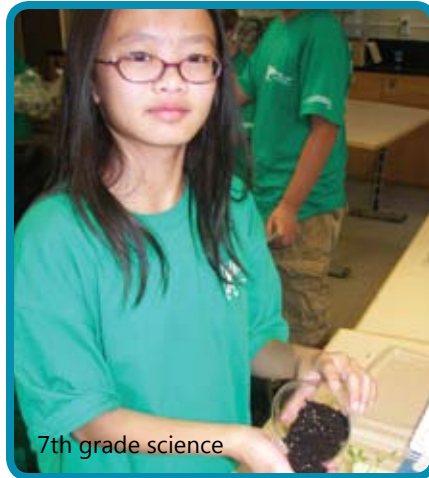
7th grade science