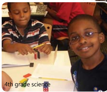
4th grade science