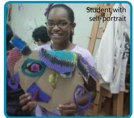
Student with self-portrait