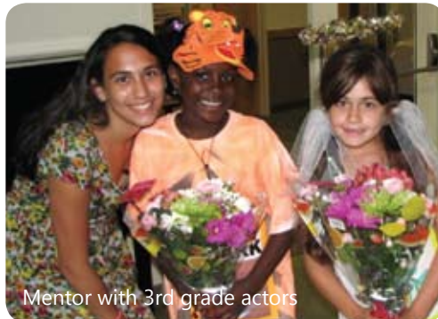
Mentor with 3rd grade actors