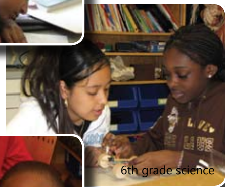
6th grade science