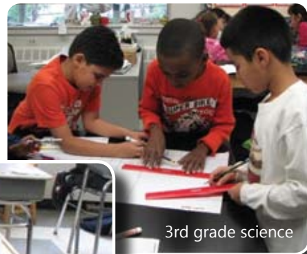
3rd grade science