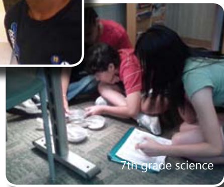
7th grade science