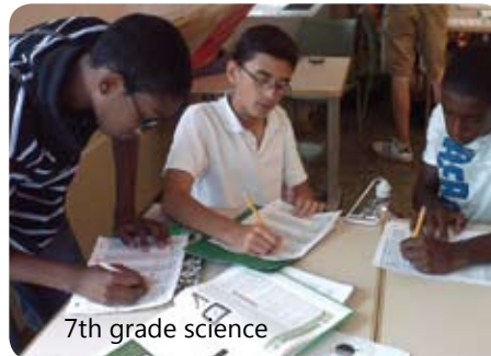
7th grade science

De La Salle Academy: 9 students Horace Mann School: 2 students The Cathedral School: 1 student George Jackson Academy: 6 students