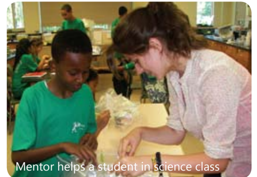
Mentor helps a student in science class

SOH's college graduates are entering the fields of education, finance, law, medicine, and technology. They include: