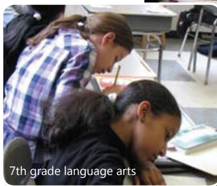
7th grade language arts