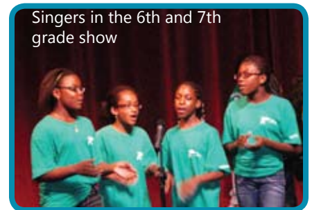
Singers in the 6th and 7th grade show