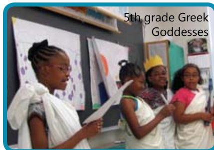
5th grade Greek Goddesses