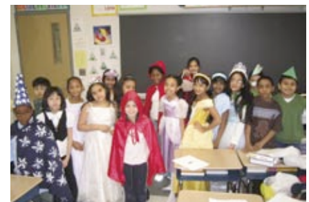
The children in 4A and B loved reading and discussing fairy tales. SOH's 4th grade language arts classes concluded the unit with a costume party of favorite characters.

Fifteen SOH students will enroll in independent elementary and middle schools in the fall. These students will not be eligible to continue in SOH's Grade 3-8 program, which is for public school students only, but are welcome to participate in the High School Program when they reach 9th grade. SOH staff sends best wishes to students leaving SOH for the following schools: