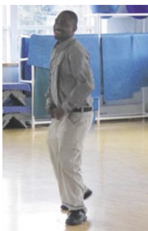
A SOH student tap dances in a Vassar studio