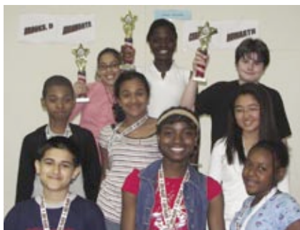
Winners of SOH's Middle School Spelling Bee