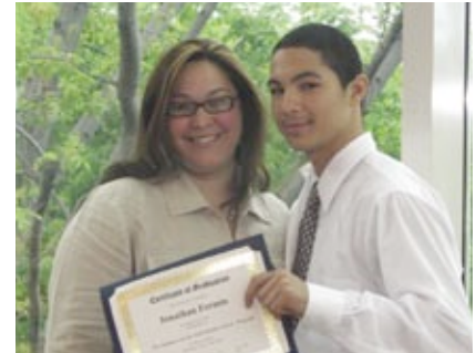
Graduate with Parent

DeWitt Clinton High School, MACY Honors Program