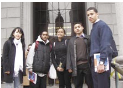
SOH Students at the NYS Supreme Courthouse. Court staff took them on a tour of the building, explained the legal system and discussed legal careers.