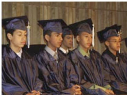
Graduating 8th Graders

Riverdale Kingsbridge Academy (2 students)