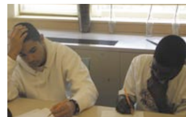
Writing class at SOH